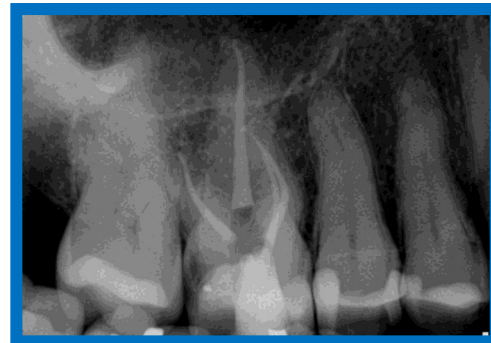
To this in 30 Min

80% of General Dentist perform RCT everyday in their practice. However, many acknowledge they sometimes struggle. Often they simply refer them out. After performing over 1 million RCT procedures our group of 30 Endodontist have discovered a way to massively simplify this process and have successfully trained many General Dentist to do these procedures in 30 min or less.