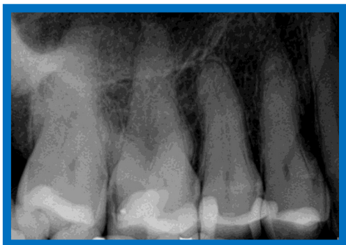
Go From this